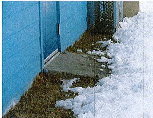
Photo 2: Replace the concrete stoop to eliminate the rise at the threshold, enlarge to provide maneuvering clearance and eliminate the slope at the entry.