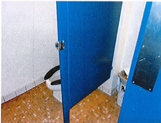
Photo 4: View of toilet room. There are currently no features of accessibility provided.