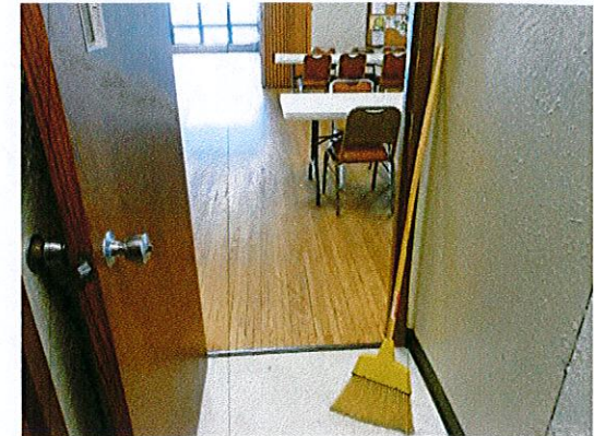
Photo 3: Maneuvering clearance is not currently provided at the single door into the community room. Replace the knob style hardware.