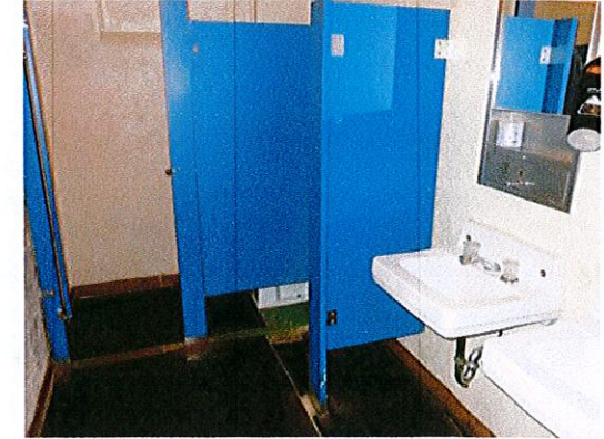
Photo 6: View of lower level toilet rooms. There are currently no features of accessibility provided.