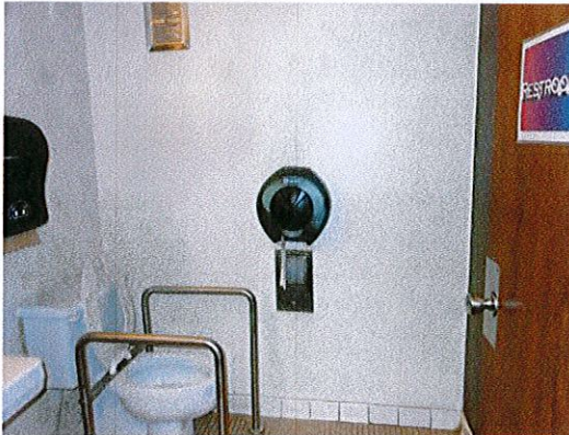
Photo 4: View of lobby single user toilet room. Replace the existing grab bar configuration with compliant side and rear wall grab bars. Replace the knob style hardware.