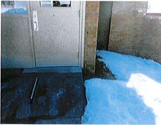
Photo 1: Modify to provide level (2% max) maneuvering space at the upper level entry door.