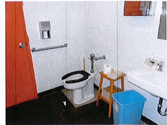
Photo 3: The women's toilet room is large enough to provide accessibility. Convert this to a single-user accessible toilet room.