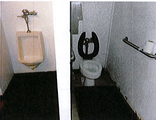
Photo 4: The men's toilet room does not currently provide any features of accessibility.