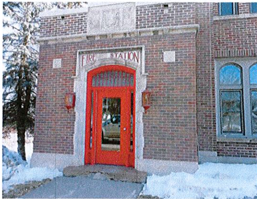
Photo 1: View of main entry. Eliminate the step and replace the knob with a style that does not require grasping, pinching or twisting to operate (such as a lever).