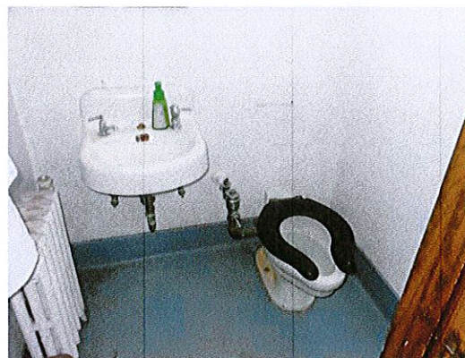
Photo 5: View of single user toilet room on the ground level. There are currently no features of accessibility provided.