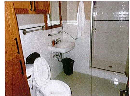
Photo 6: View of upper level bathroom. There are currently no features of accessibility provided.