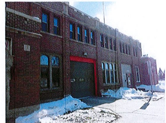
Photo 3: Half of the ground level and the lower level was formerly occupied by the community center. Remodeling occurred to improve accessibility.