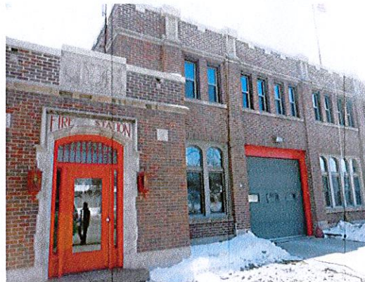
Photo 2: There is not currently an accessible route (elevator) between levels.