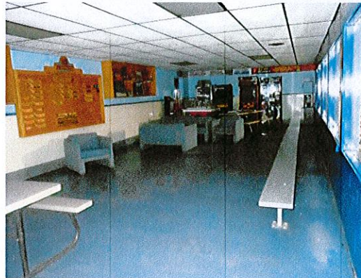
Photo 2: The upper level provides concessions, toilet rooms and a seating/viewing area. There is not currently an accessible route to the upper level.