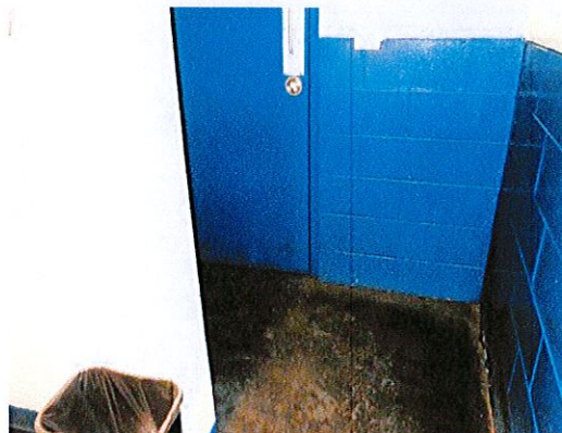
Photo 5: Remove the privacy wall at the single user accessible toilet room (it currently obstructs maneuvering clearance at the door). A privacy lock is already provided.