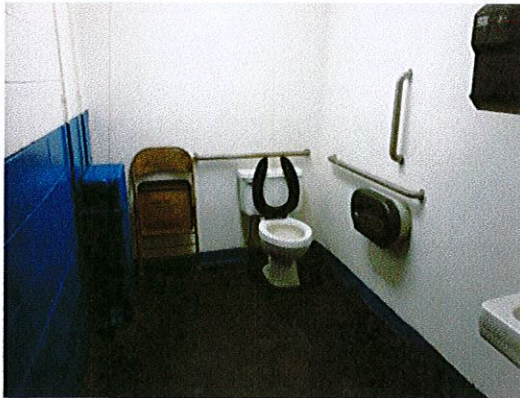
Photo 4: A single user accessible toilet room is provided on the main level. This is a good example of accessibility.