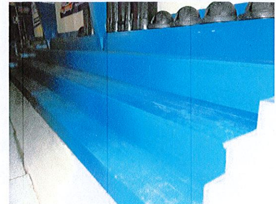
Photo 3: The spectator seating area is not currently located on an accessible route and does not provide wheelchair positions.