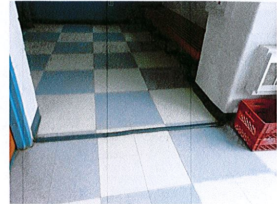
Photo 3: Eliminate the 1" rise where the addition connects to the original structure.