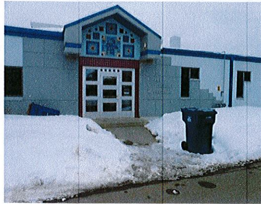
Photo 2: Create an accessible route to the main entry. There is currently a step.