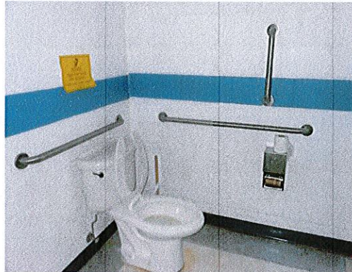
Photo 5: View of single-user toilet room. This is a good example of accessibility.