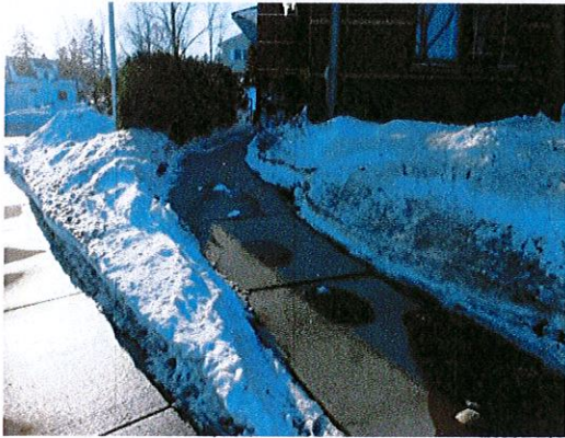
Photo 1: Modify the route to the main entry so it does not exceed 5% (currently as steep as 12%).