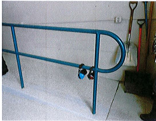
Photo 2: Add handrails at the ramp in the garage area. (Currently a guardrail on the open side.)