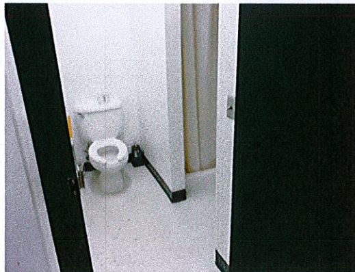
Photo 5: View of locker room. There are currently no features of accessibility provided.