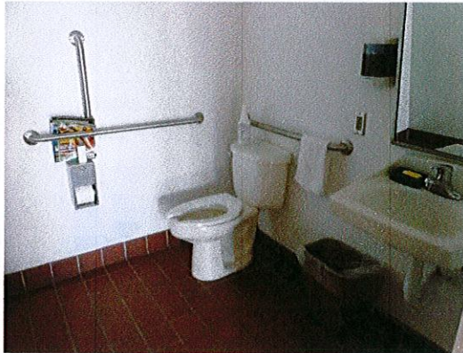
Photo 4: View of lobby toilet room. This is a good example of accessibility.