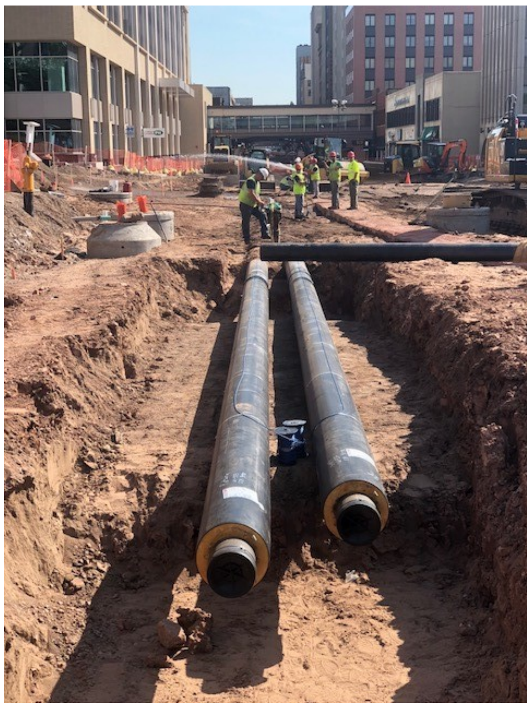
hot water lines installed