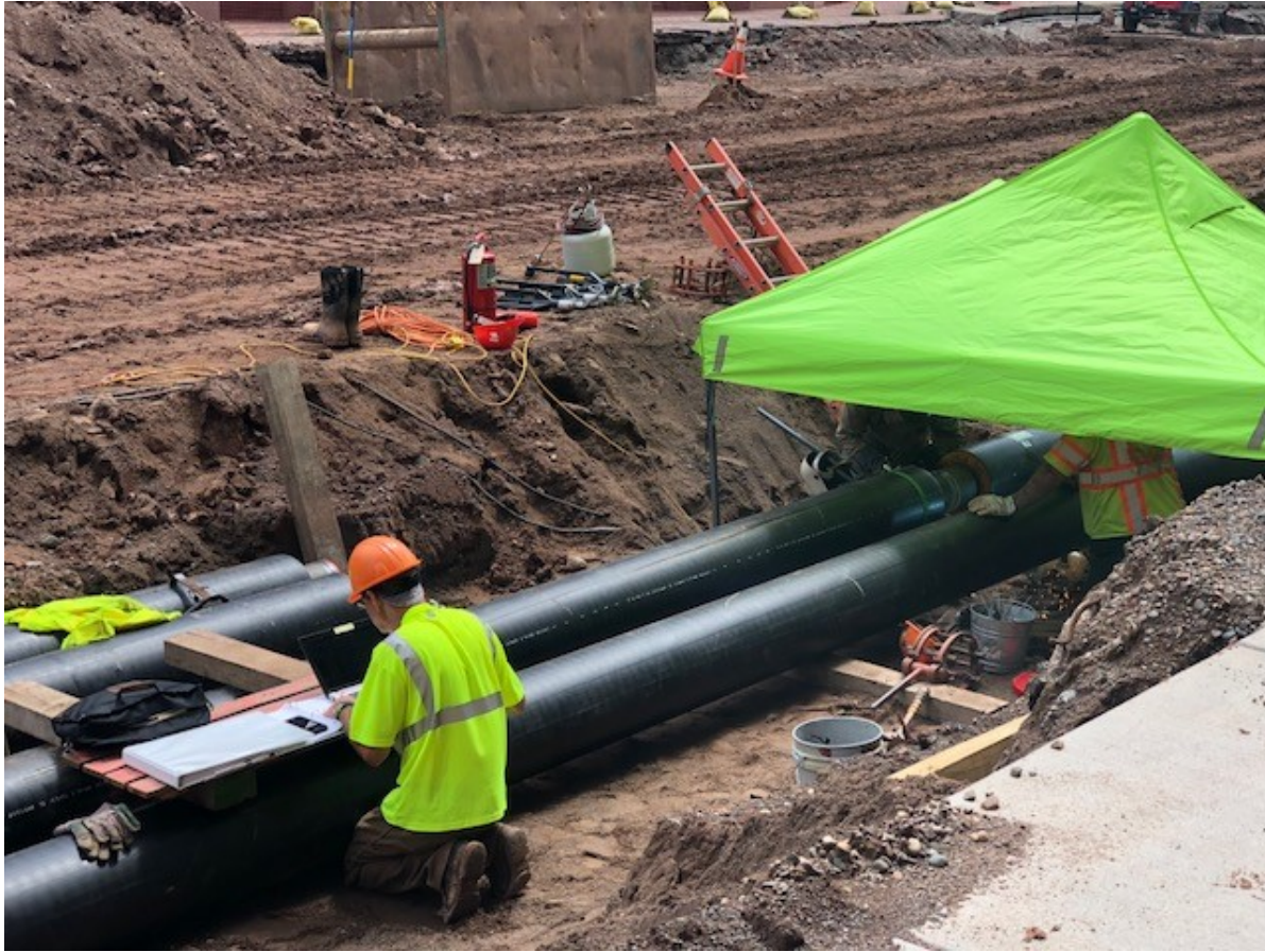
Stack Bros. working on fine details for hot water installation