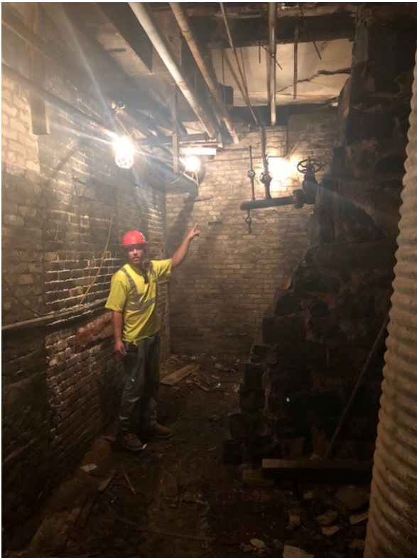
Northland staff member in the Northland Building vault.