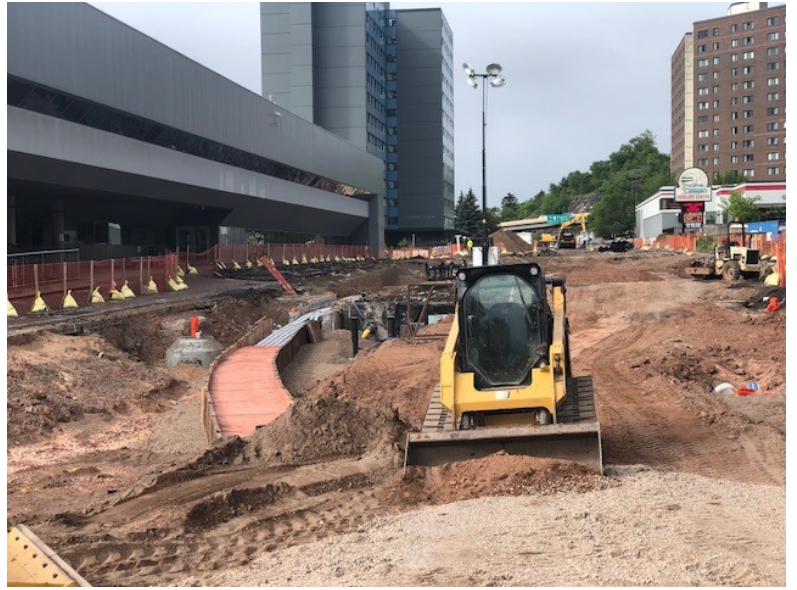
Electrical duct running to the skywalk tunnel between the Radisson and the Library.