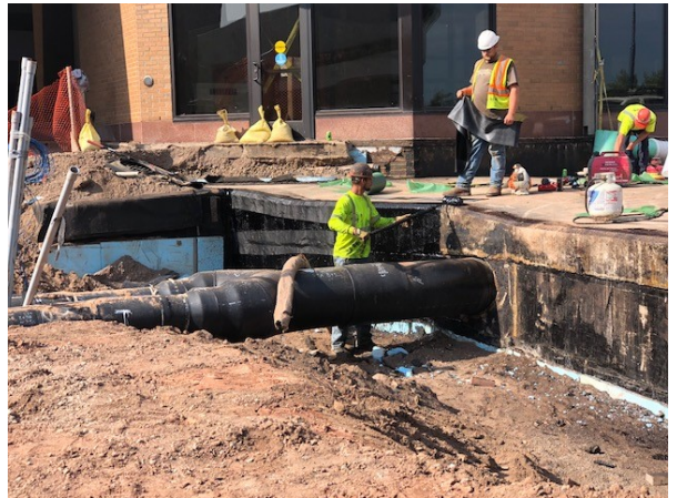
waterproofing the skunnel