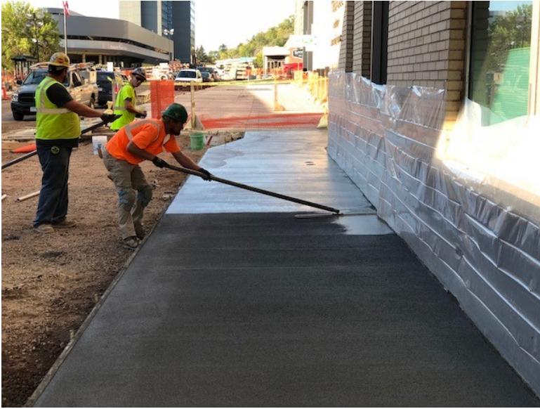
finishing touches on new concrete for sidewalk