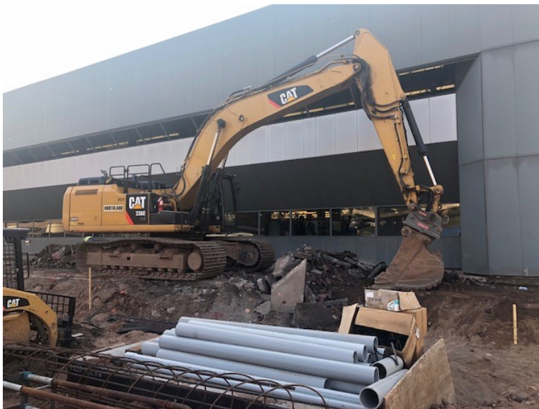
preparing for vault work in front of the Duluth Library